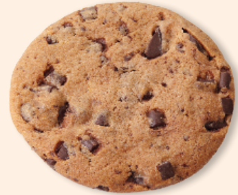
CHUNKY CHOC CHIP