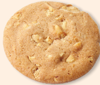
WHITE CHOC MACADAMIA NUT