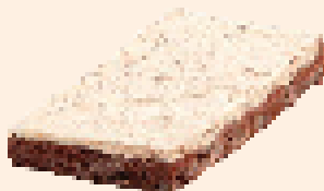
COOKIES & CREAM SLAB