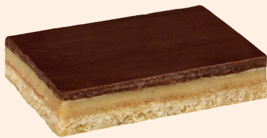
CHOC CARAMEL SLICE

Available in a box of 28 pre-cut slices.