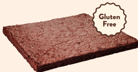
BROWNIE SLAB CHOC FUDGE GF