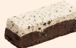
COOKIES & CREAM FINGER SLICE 30's