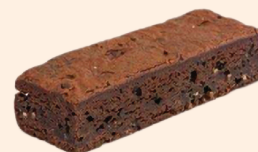
BROWNIE FINGER SLICE CHOC FUDGE 30's