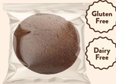
COCOA HIT GF/DF