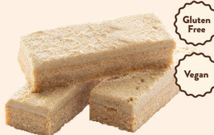
GINGER CRUNCH FINGER SLICE 30's