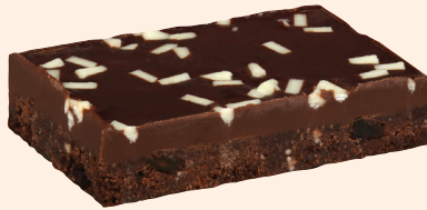
CHOC FUDGE SLICE