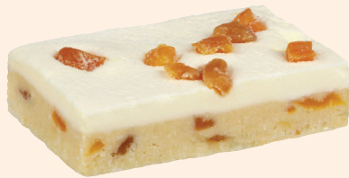
APRICOT CITRUS SLICE