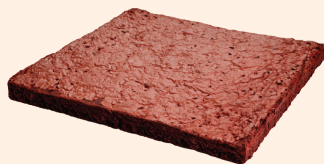
BROWNIE CHOC FUDGE SLAB